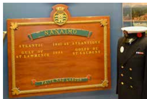
The battle honours board of the original HMCS Nanaimo, a corvette, is on display at VIMM. HMCS Nanaimo was commissioned at Esquimalt in 1941 and served in both the Atlantic and Pacific during the Second World War.