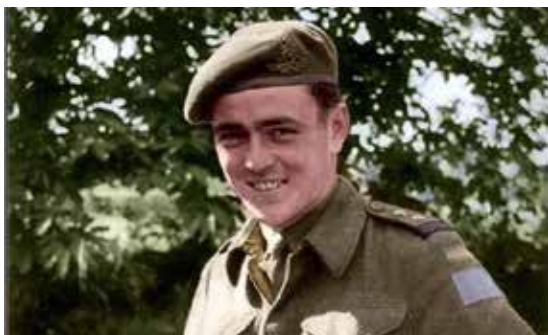
James Doohan, 13th Field Regiment, Royal Canadian Artillery.

After the war, Doohan worked in radio while studying in London ON and was soon making national appearances on CBC radio. With the CBC and occasional acting jobs in the USA, he performed in 4000 radio shows and 450 television programs. In 1965, he was cast as engineering officer Scotty Montgomery on the science fiction series Star Trek. The rest is history.