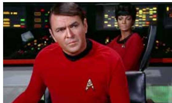
James Doohan as Scotty on Star Trek.