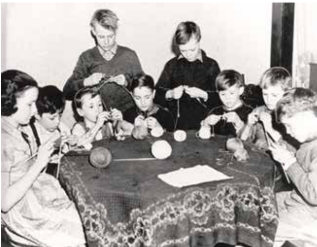
Children learned to knit socks, scarves, and mitts for the troops.

In the end, the considerable efforts, and the hardships and sacrifices made by the children of that time, serve as a reminder of what Canada’s youth can do when they willingly put their mind to it.