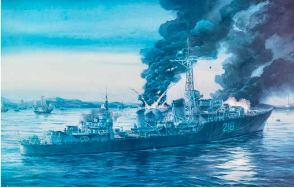
HMCS Cayuga in action at Chinnampo.